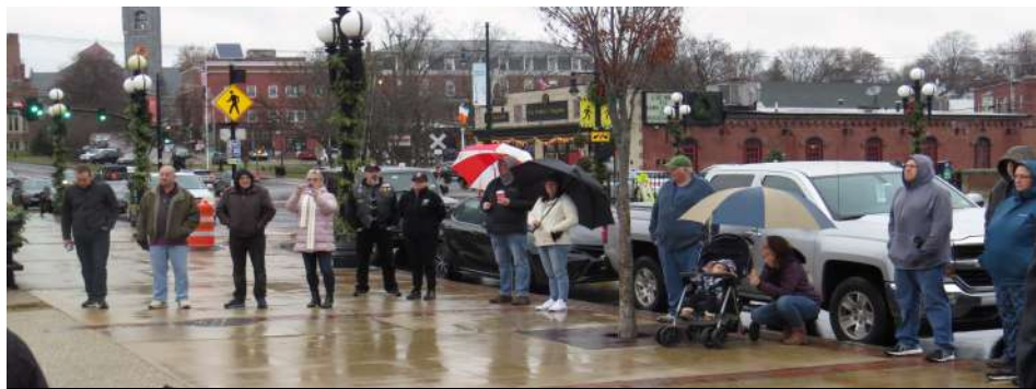
Some of the people that came out on a cold rainy day for the Pearl Harbor