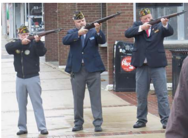
Rifle salute fired by VFW and American Legion members.