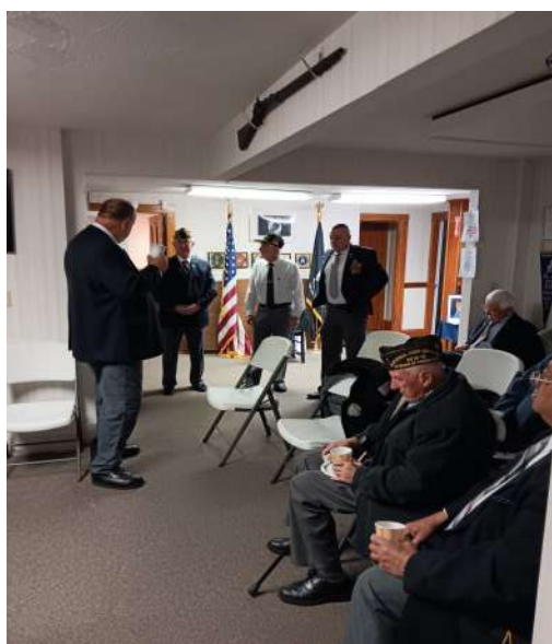
Members before the ceremony having coffee and donuts.