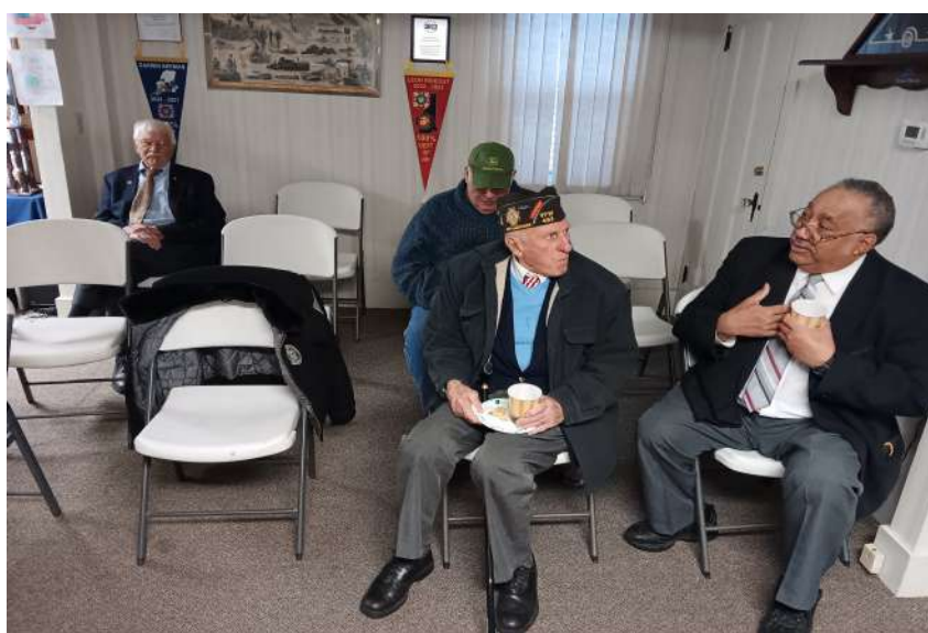
Members before the ceremony having coffee and donuts.