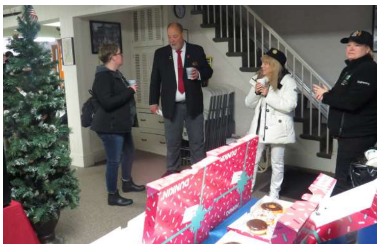
More ceremony participants enjoying the coffee and donuts following the ceremony.