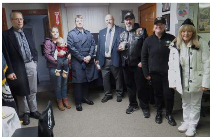
Ceremony participants at the Post .

Veterans Coffee Talk Friday, 12 January, 2024 at 0930, at the Nashua Senior Center.