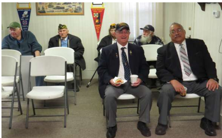
Some members enjoying coffee and donuts at the post following the ceremony.