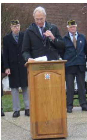
Nashua Mayor Jim Donchess speaking.