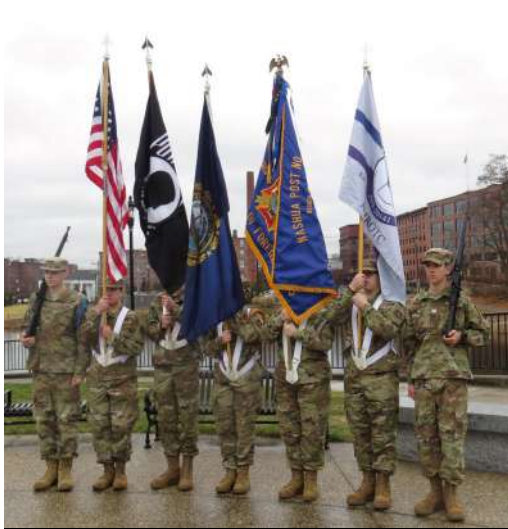
Nashua High School Jr. Air Force ROTC color guard.