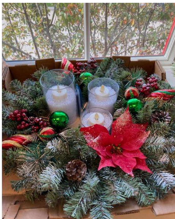
Nashua VFW Post 483's entry into the Lions Club Festival of Wreaths, Table Top Trees and Centerpieces contest held at the Nashua Senior Center on Friday and Saturday, December 1 & 2, 2023.